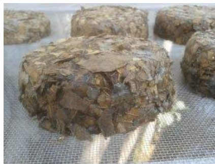
Fig 3. Briquette Fuel

After litter productions and binder was mixed, the material is fed into the fuel Manual Pressure Machine (MPM). The machine was built to operate the strength of one-ton pressure by jack. The machine had 10.5 cm. diameter and 35.6 cm. length of PVC pipe. The process of briquettes fuel making was taken 300 grams of material in to pipe by inserting separate sheet for other cubes. This machine can produce four fuel cubes for one time process. Tack the briquette fuel productions to measure, to weigh and record. Then it is kept sun-dried for 3 days and take the dried briquette fuel to measure and to weight it again. (Fig 2-3). (Thoongsap, 2009.).