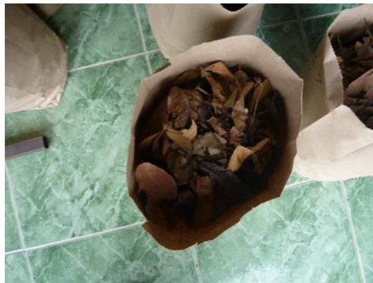
Fig 1. Leaf litter

B = weight of specimen after heating in moisture test, (gram).