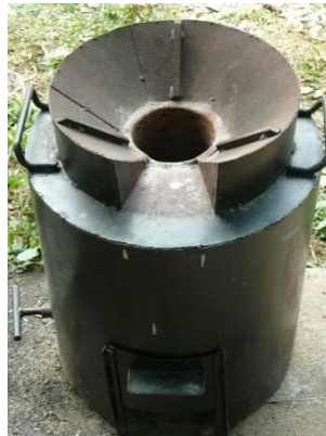
Fig 4. The cylindrical biomass stove (Jodnok et al, 2011).

Heating value analysis was determined of the gross calorific of briquette fuel by adiabatic bomb calorimeter in SI unit. (ASTM 5865-10, 1996). The sample was weighed and burn under the controlled conditions by the oxygen bomb calorimeter. The higher heating value was calculated from the temperature rise to the water in the calorimeter vessel and the effective heat capacity of the system. Corrections were made for the heat released by the ignition of the fuse and the thermo chemical reactions forming nitric and sulfuric acids.