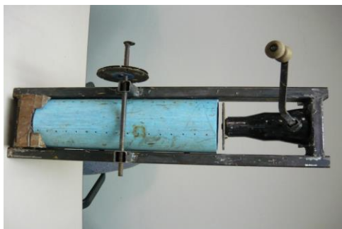
Fig 2. Fuel manual pressure machine